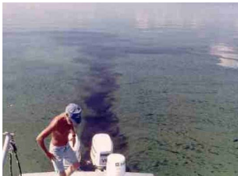
Cyanobacteria bloom created by excessive phosphate pollution